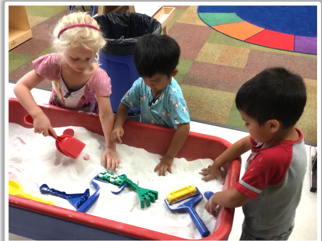
Cooperating at the sensory table during Active Learning